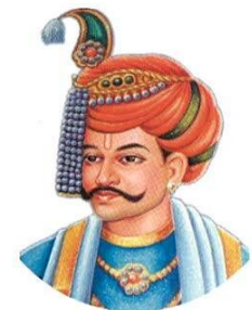
SRI KRISHNADEVARAYALU The King of Vijayanagara Empire (Hampi)

International Spiritual Centre, Prashanthi Nilayam, Puttaparthi is near to Ananthapuramu.